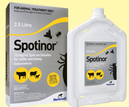
Spotinor 2.5Ltr ONLY €129