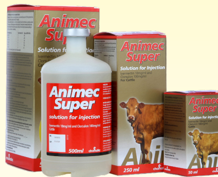
Animec Super 500ml Injection BUY 2 SAVE €50