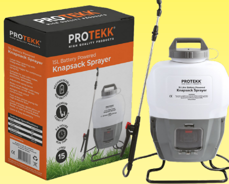
PROTEKK 15 LITRE BATTERY SPRAYER ONLY €99