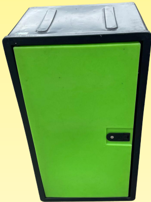
Platinum Medicine store ONLY €169