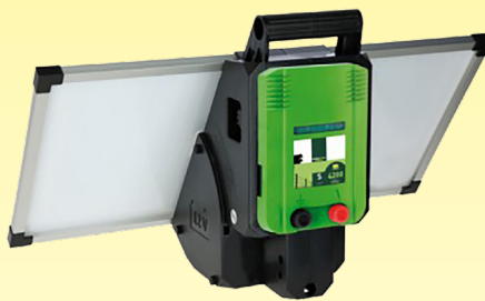
FARMSTOKK SOLAR FENCER S4200 ONLY €549