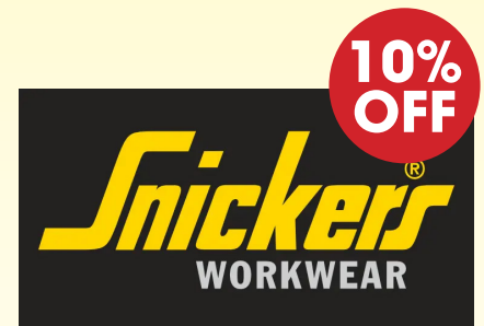
Snickers Workwear 10% OFF ALL PRODUCTS