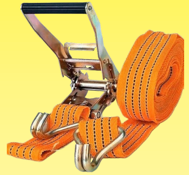
PROTEKK RATCHET STRAP 10MTR X 5TON BUY 2 FOR €29.95