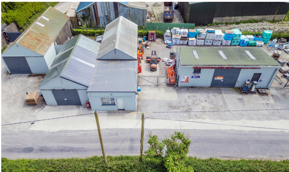
Darrara branch photo thanks to Gearóid Holland.

A survey of the Darrara area indicated that 450 cows were pledged to supply milk to the new auxiliary and that should increase to