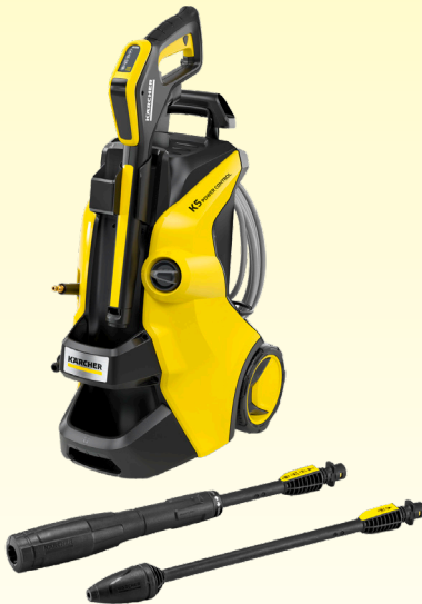
KARCHER K5 CLASSIC PRESSURE WASHER ONLY €299